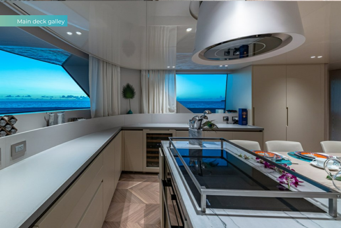
Main deck galley