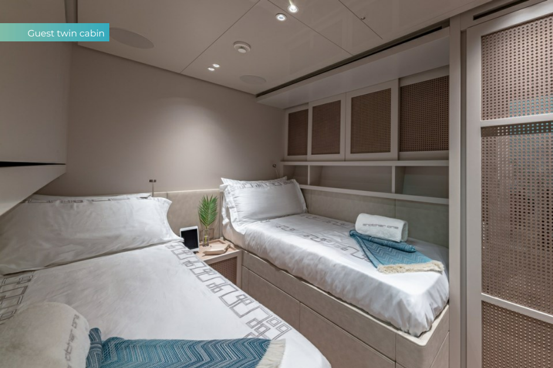
Guest twin cabin