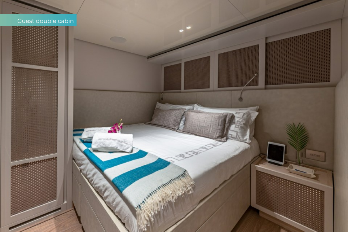
Guest double cabin