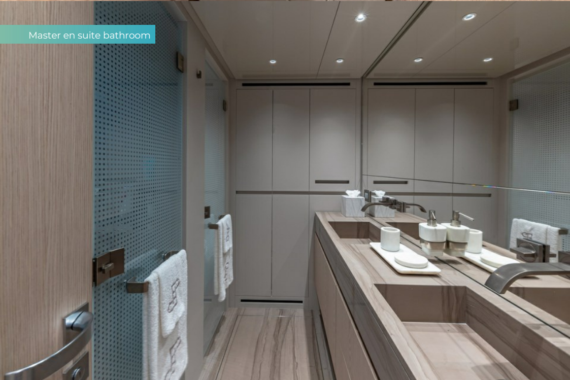
Master en suite bathroom