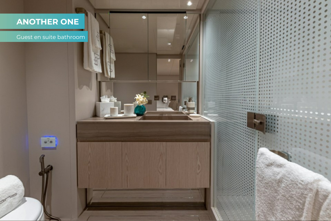
Guest en suite bathroom