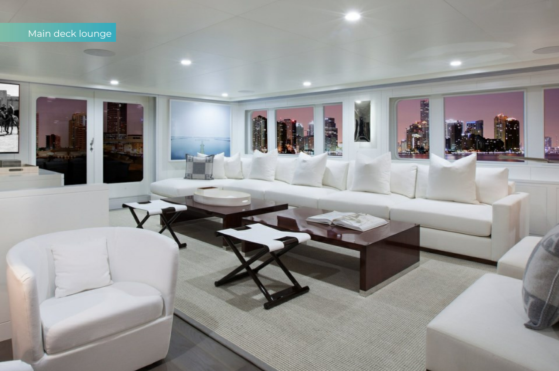
Main deck lounge